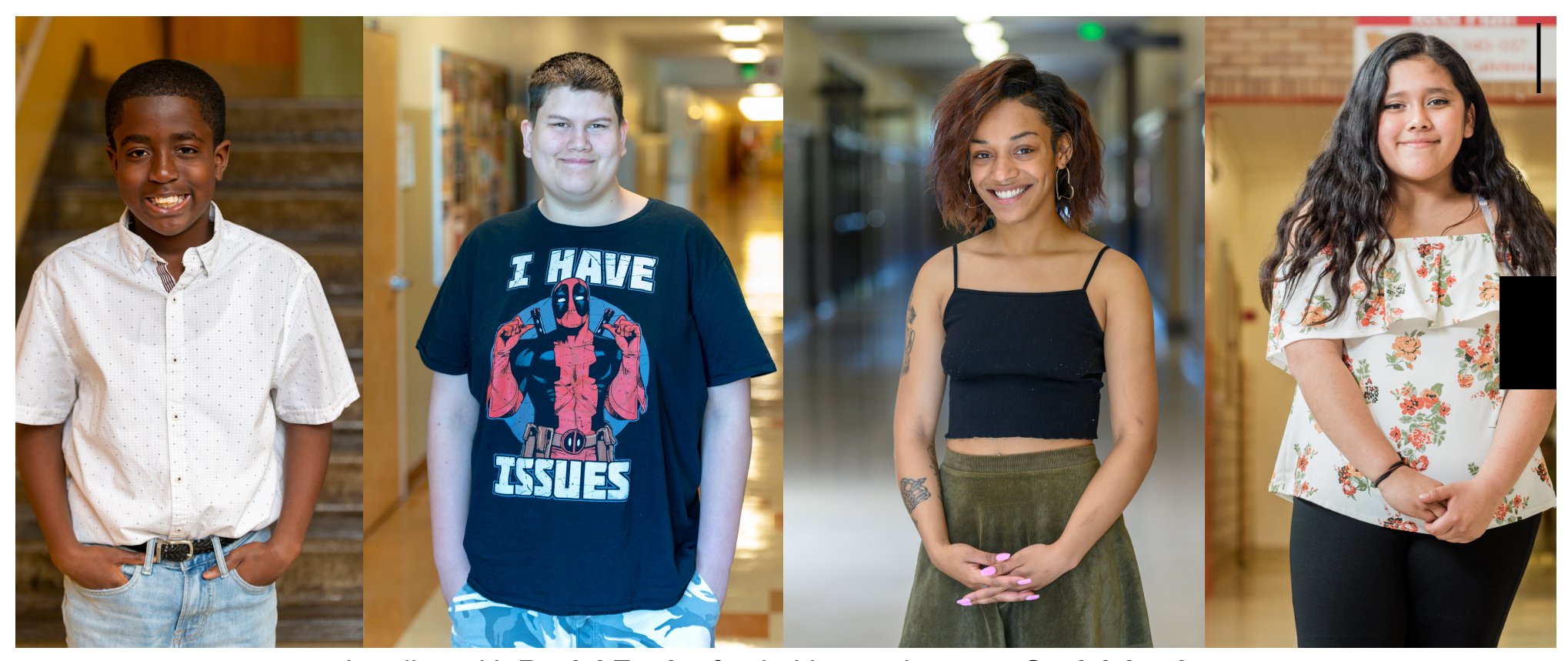
Leading with Racial Equity & a bold commitment to Social Justice.